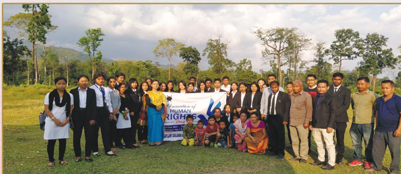
Observance of “Human Rights Day” at Saralpara, Kokrajhar