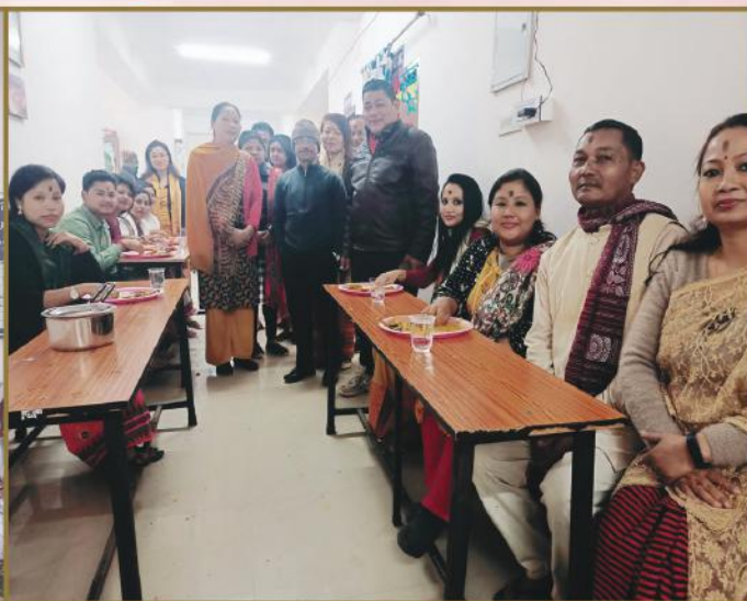
A View of Celebration