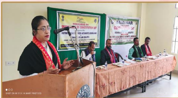
Observance of “National Law Day” at Kokrajhar Law College, Kokrajhar