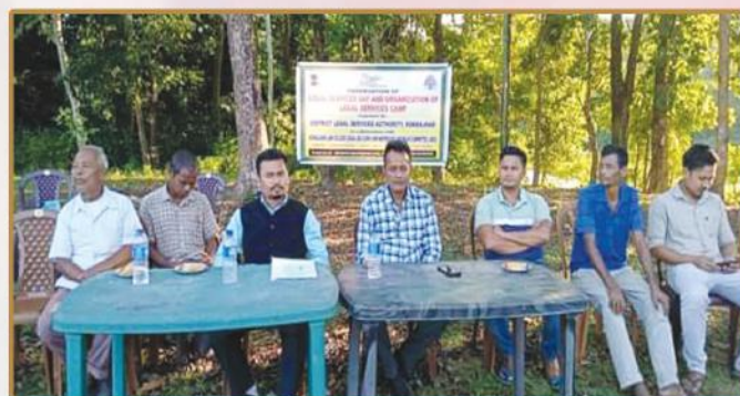
Observance of “Legal Literacy Day” at Village- Dabwrgaon, Kokrajhar